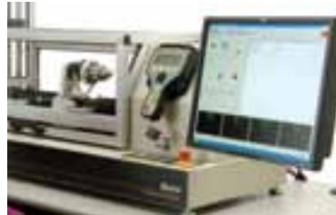
The Bionix EM Torsion test system integrates an electromechanical load frame, advanced digital controls and powerful application software to test components and tools subject to torque loading.