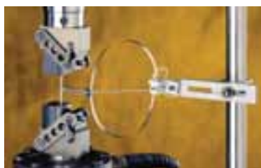
The MTS Model 632.32 Biomedical Extensometer enables highly accurate measurements of strain on soft tissue specimens with minimal contact force effects.