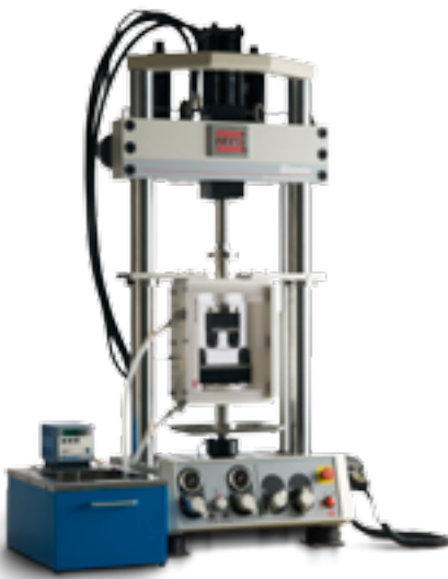
MTS provides everything test professionals need to evaluate material and structural properties. Our fully integrated solutions include advanced load frame technology with intuitive digital controls and industry-leading application software.

Acquire meaningful, high-quality test data about a wide variety of tools, hardware and consumables with MTS solutions for quality assurance and control. Bionix electromechanical testing systems enable universal testing for cosmetic implant materials, joint replacement compounds, soft tissue materials, medical tubing, tape and sutures. Our electromechanical torsion test systems are ideal for orthopaedic bone screws, constructs and tools, as well as tubing, catheters, torsion springs and lead wires. MTS also offers specialized systems for testing hypodermic and surgical needles, and hip replacement hammers.