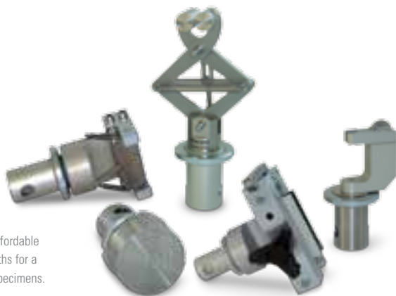
Bionix accessories includes affordable grips, fixtures, platens and baths for a diverse range of biomedical specimens.

Biomedical researchers and developers have rapidly evolving needs. To make sure our biomedical test systems serve as viable long-term platforms in your laboratory, MTS provides everything you need to extend the capabilities of your current system, adapt to new test requirements and protect your investment.