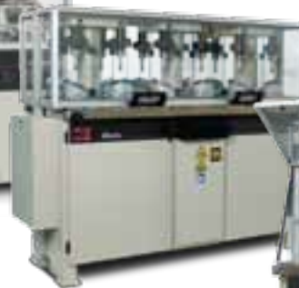
Hip Wear Simulator

Modular and scalable Bionix Orthopaedic Subsystems integrate with Bionix Tabletop Servohydraulic Test Systems, FlexTest® Controllers and MTS application software to create complete solutions for demanding applications in biomechanical research.