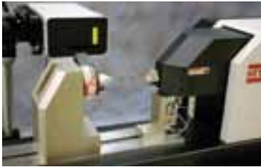
Designed to test small specimens under low loads, the Tytron™ 250 Microforce Testing System enables precise characterization of electronics, medical devices, polymers and other materials.