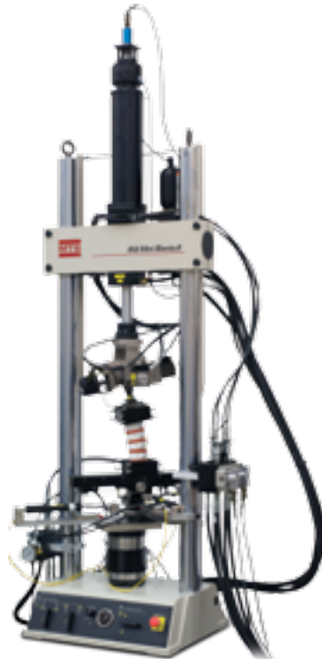
The compact Bionix axial/torsion system is ideally suited for a wide range of biomaterial and biomechanical test applications. These systems, coupled with Bionix subsystems, enable researchers to test for durability and wear, as well as conduct kinematic studies on orthopaedic implant devices.