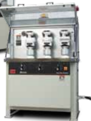
Knee Wear Simulator

Modular and scalable Bionix Orthopaedic Subsystems integrate with Bionix Tabletop Servohydraulic Test Systems, FlexTest® Controllers and MTS application software to create complete solutions for demanding applications in biomechanical research.