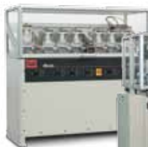
Spine Wear Simulator

Develop effective treatments for spinal injuries and disease with MTS solutions for kinematics studies and wear simulation. The Bionix Spine Kinematics Subsystem enables you to gain extensive knowledge of the complexities of spine kinematics by applying real-world forces and motions to cadaveric spine specimens. MTS also offers both single- and multi-station spine wear simulators for highly accurate, long-term wear, fatigue and durability simulations.